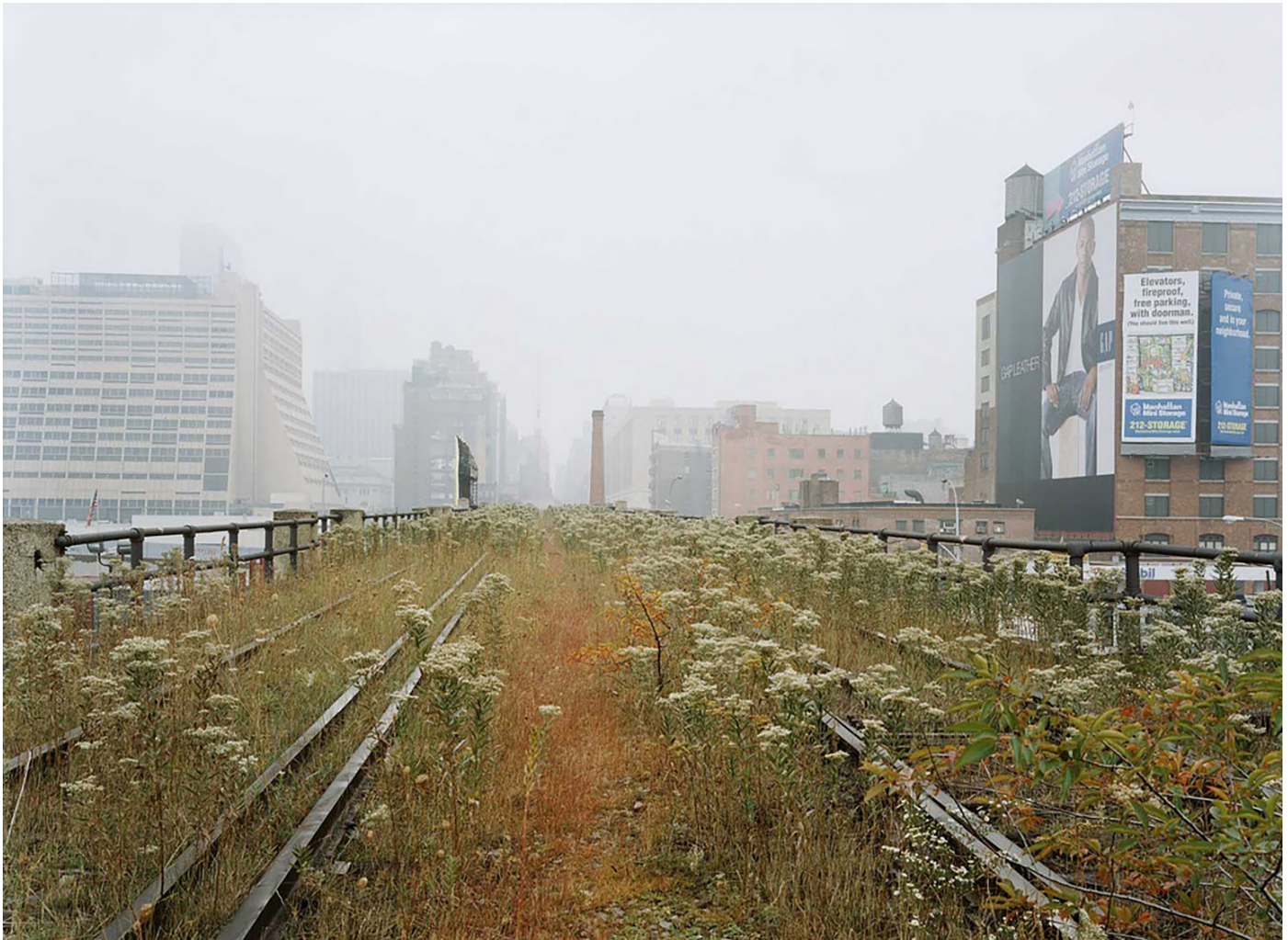
Figure 4: Joel Sternfeld. High Line, Looking East.

Ruderal occupation is the subject of much contemporary landscape photography—often called “ruin porn”—published in folios such as Joel Sternfeld’s High Line images (fig. 4), photographers Andrew Moore ( Detroit Disassembled , 2010), Camilo Jose Vergara ( American Ruins , 1999), and James Griffioen ( Feral Houses, Lost Neighborhoods , 2009). These images play on the oscillation between pathos of abandonment and the riotous optimism of the ruderal vegetation occupying the ruins.