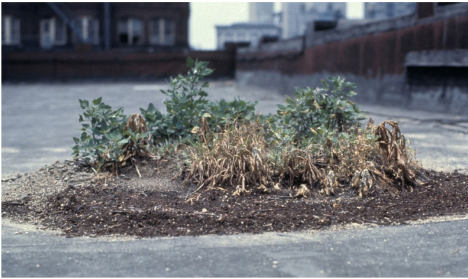
Figure 3: Hans Haacke Bowery Seeds

endeavor. Grosse's previous monumental works of "painting" combined multiple hues that dematerialize the figure and form of its various substrates: including beds, walls, soil, or large shards of cut polystyrene. In psychylustro , the hues are separated by hundreds of feet, yet they meld in time, as the fluorescent paint occupies the rail passenger's retinal after-image before encountering the next pulse of lurid green, orange, then pink. It touches on op art: solid color is transformed into a work of colored light. psychylustro is a landscape; it is a landscape painting, and a landscape painting 9 . Unlike typical murals, psychylustro lacks figures, allegory, message, sentiment, nostalgia nor obvious optimism.