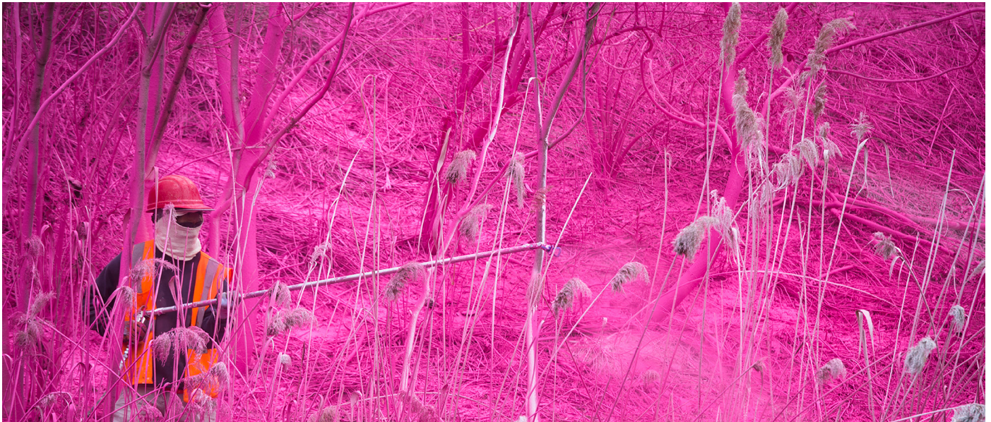
Figure 1: Katherina Grosse: psychylustro .

“explained as temporary anomalies” 6 . In Clement’s model, biotic actors were considered as a super organism with a telos—a goal to achieve climax condition and balance without disturbance 7 . Pickett, Parker and Fielder’s contemporary research disproved the notion of an optimal “balance of nature” by revealing that landscape processes, and disturbances in particular, had a greater influence in shaping the environment than interactions between species.