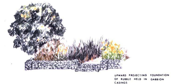
Figure 2: Harrison Studio: Trümmerflora

My analysis of works of ruderal aesthetics is parsed through a series of verbs. These verbs— demarcate , initiate , occupy , reconstitute , restitute , and stylize —demonstrate how ruderal aesthetics operate or are constructed or dispatched in site works. Katherina Grosse’s bold murals demarcate the ruderal spaces of Philadelphia’s commuter rail corridors, colonizing space with swaths of color. In works such as Hans Haacke’s Bowery Seeds , materials and formal qualities of soil and substrate are carefully considered to initiate , or lay the groundwork for, the emergence of ruderal vegetation. The political instrumentality of ruderal vegetation to occupy contested sites is illustrated by the photographs of The High Line by Joel Sternfeld. TerraGRAM’s proposal for the High Line reconstitutes the High Line of Sternfeld’s images through the construction of new layers that provide public access and highlight ongoing ecological processes. Through the redistribution of ruderal soils, the Harrison Studio’s Trümmerflora , a proposal for a memorial on the site of the former Gestapo headquarters in Berlin, builds a dialectic process of restitution , or a healing, of physical and metaphoric aspects of the site. Finally, I examine how designer team of James Corner Field Operations and garden designer Piet Oudolf stylize the ruderal vegetation into a